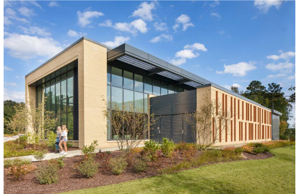
Morrisville Community Library