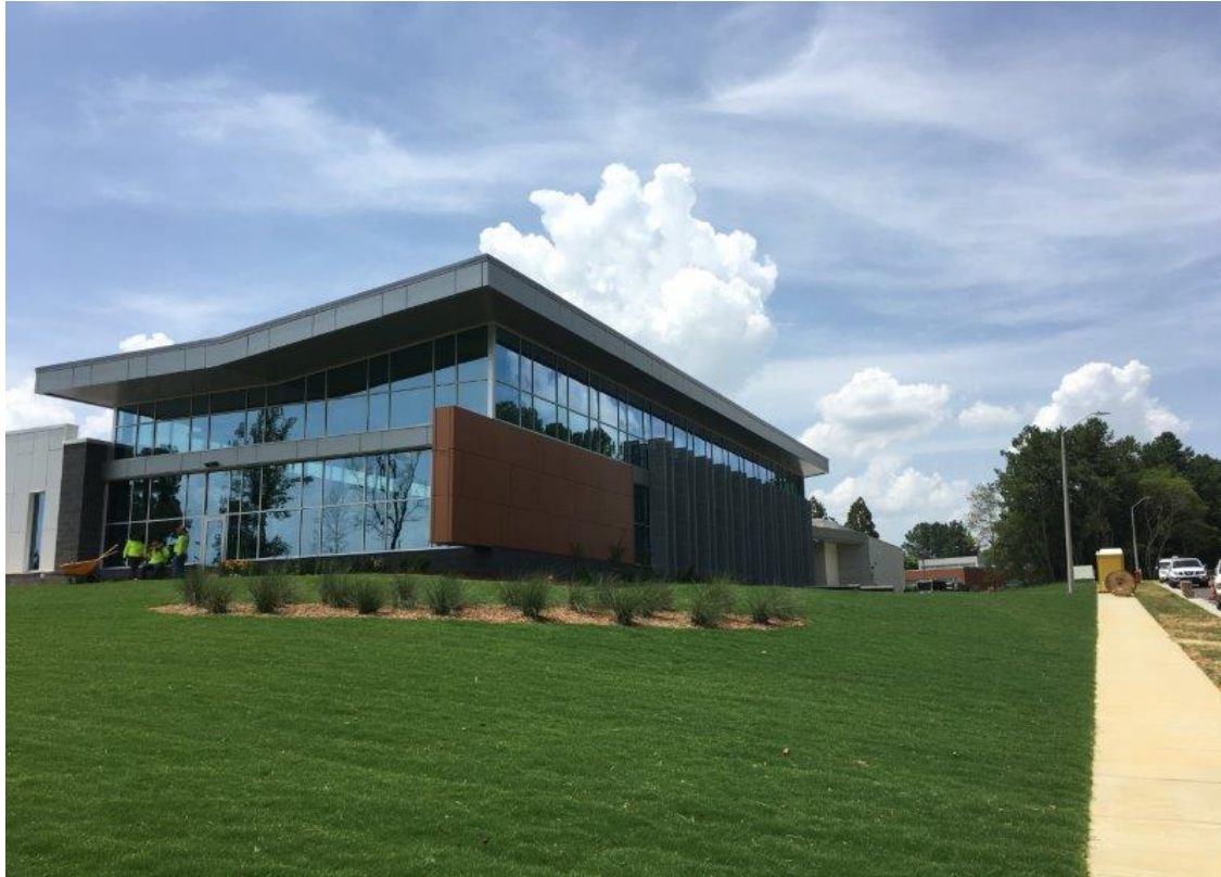
Fuquay-Varina Community Library