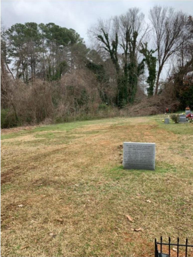
Plate 4.1: Proposed reinterment site, Section J, Oakwood Cemetery, 701 Oakwood Avenue, Raleigh, NC.