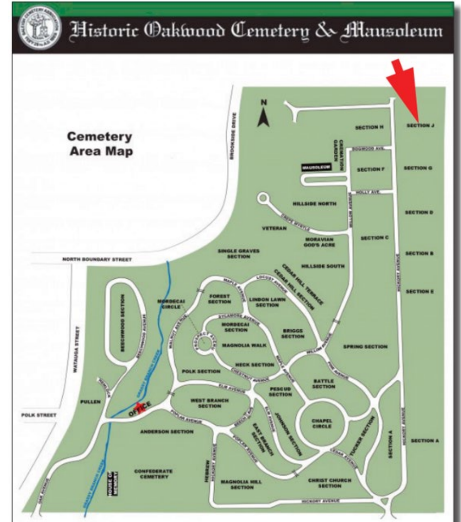
Figure 4.2: Map of Oakwood Cemetery showing Section J, proposed reinterment site for Nipper and Honeycutt Cemeteries.