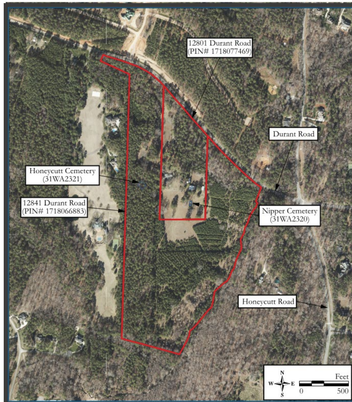
Figure 1.3: Nipper Cemetery (31WA2320) 12801 Durant Road (PIN# 1718077469) and Honeycutt Cemetery (31WA2321) 12841 Durant Road (PIN# 1718066883) ( https://services.nconemap.gov/secure/services/Imagery/Orthoimagery_Latest/ImageServer/WMServer? ).