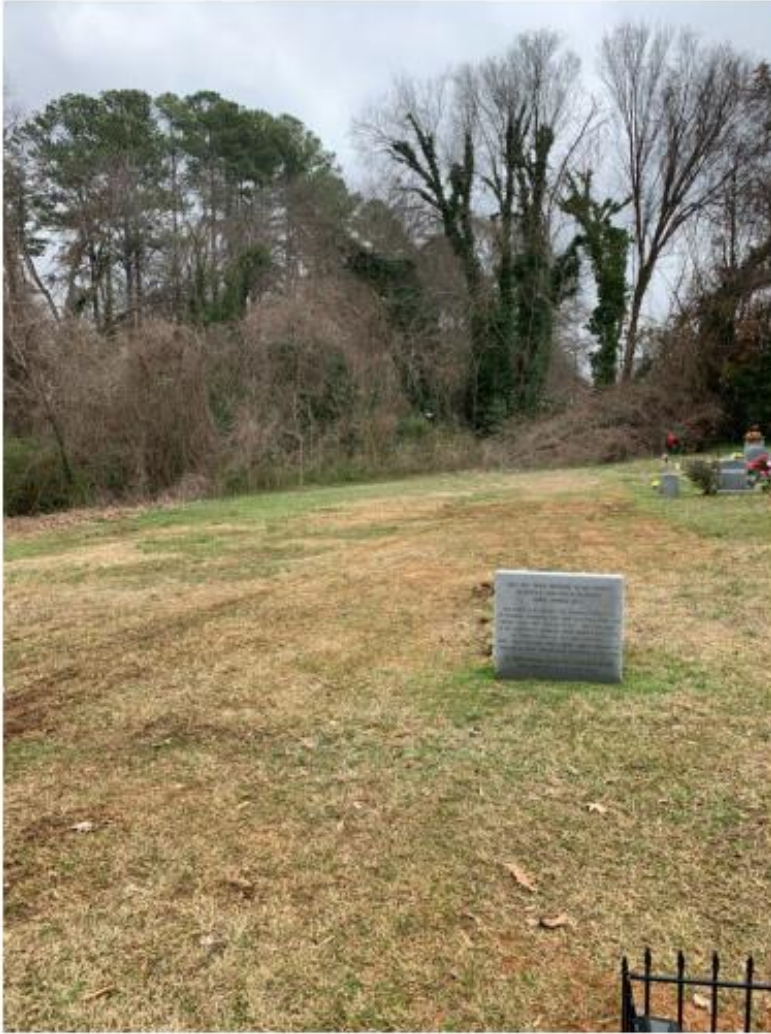
Plate 4.1: Proposed reinterment site, Section J, Oakwood Cemetery, 701 Oakwood Avenue, Raleigh, NC,