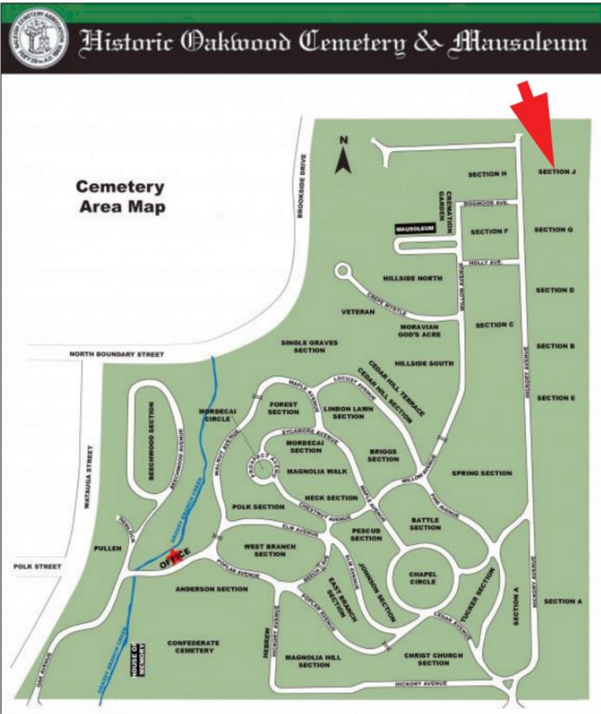
Figure 4.2: Map of Oakwood Cemetery showing Section J, proposed reinterment site for Nipper and Honeycutt Cemeteries.