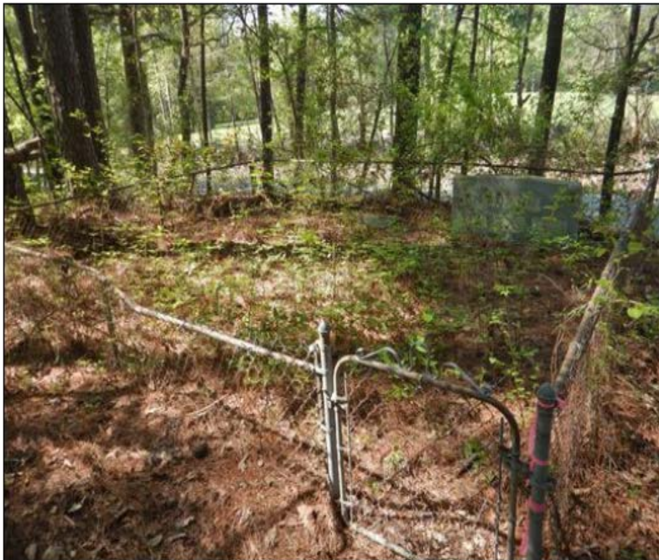
Figure 4. Jefferson Basil Wilson Family Cemetery, view southwest, White Oak Road in the background.