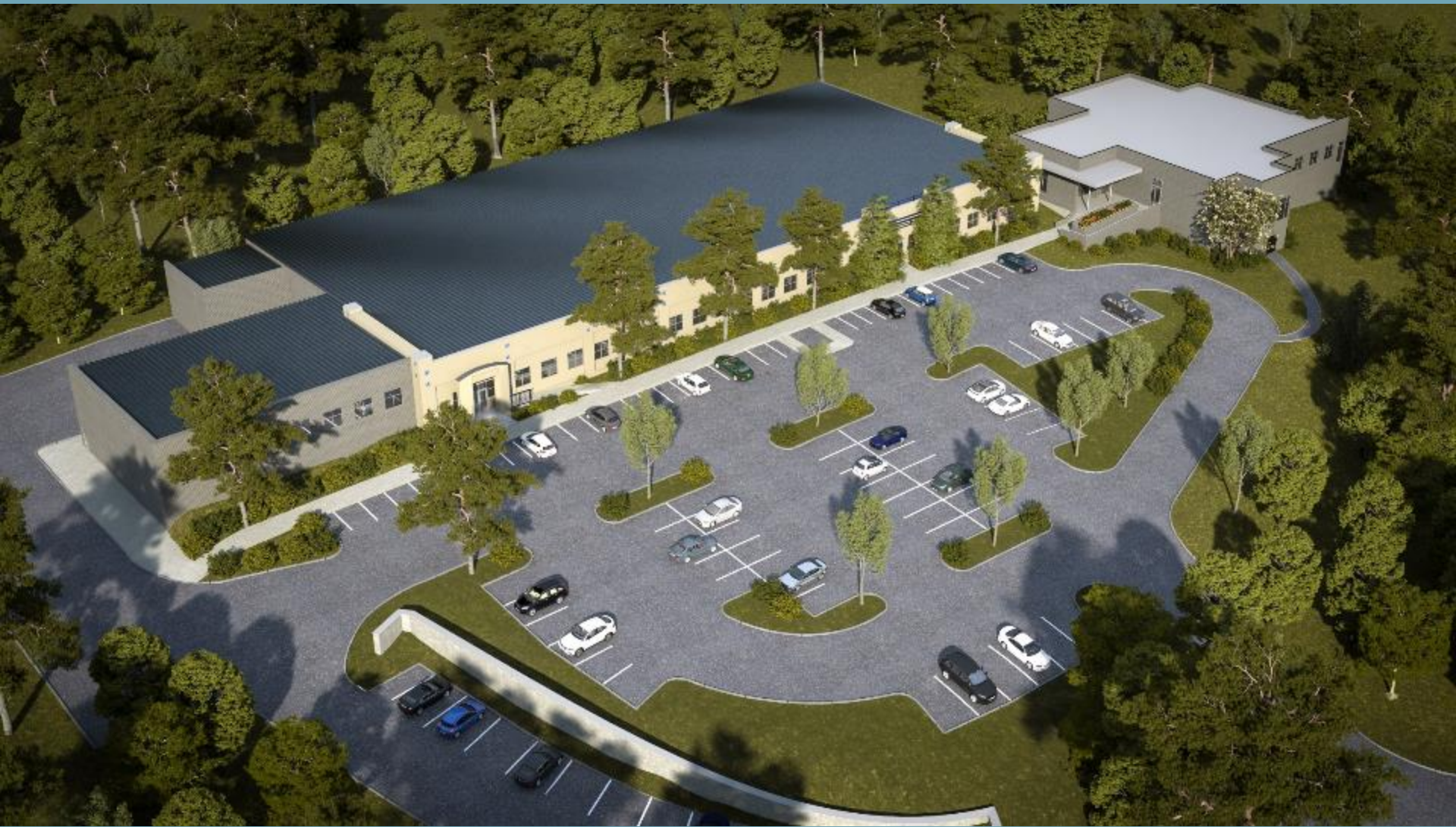
Women's Campus Rendering