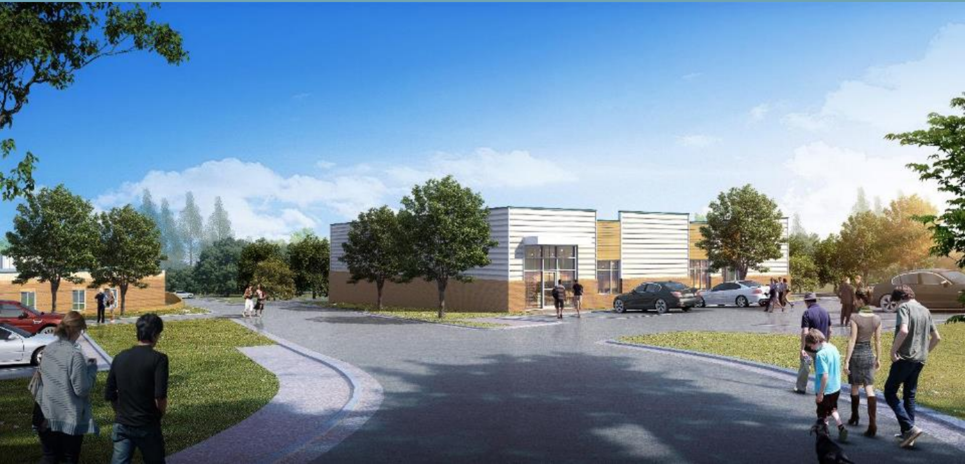
Men's Campus Rendering