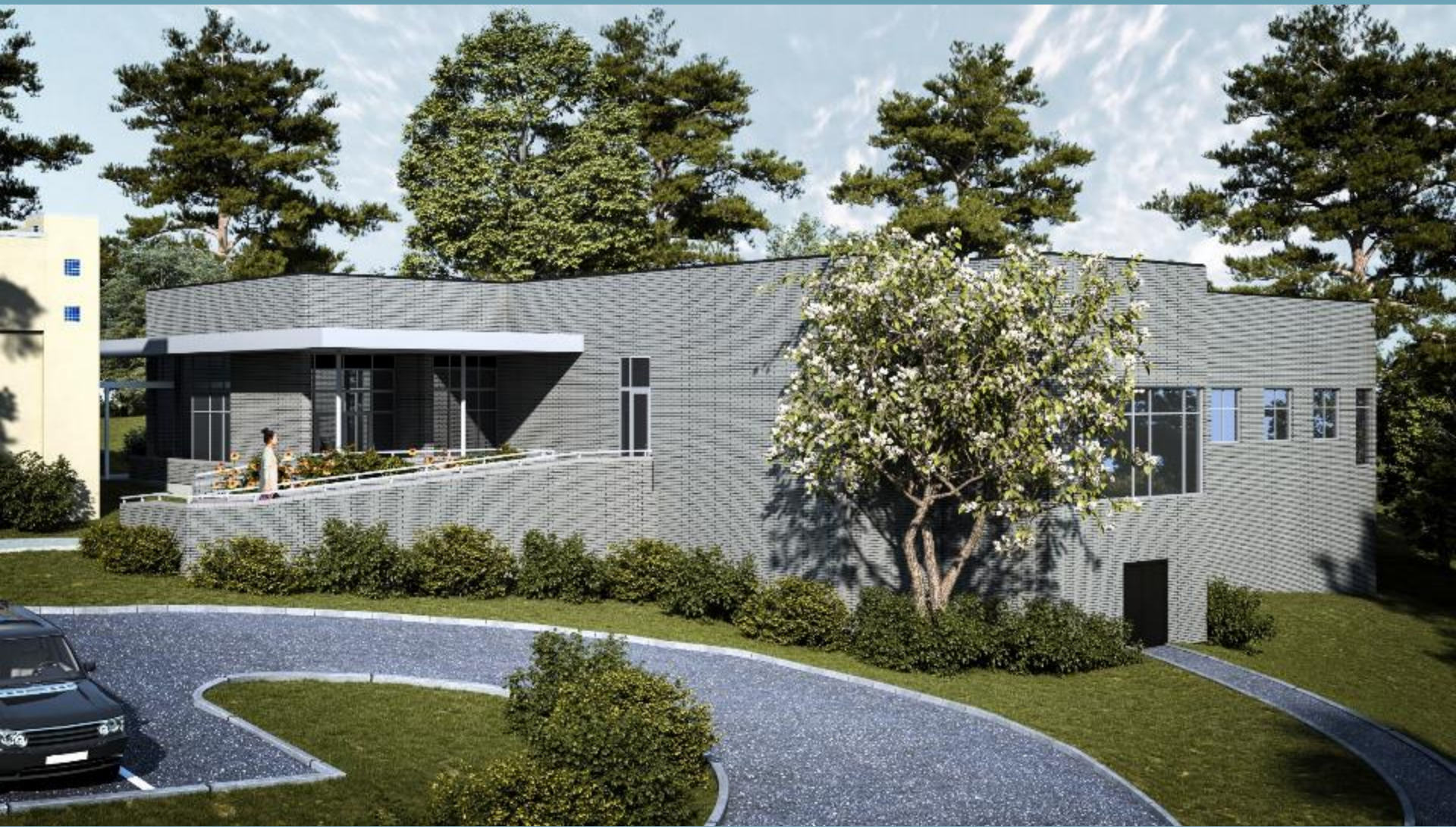
New Community/Administration Building