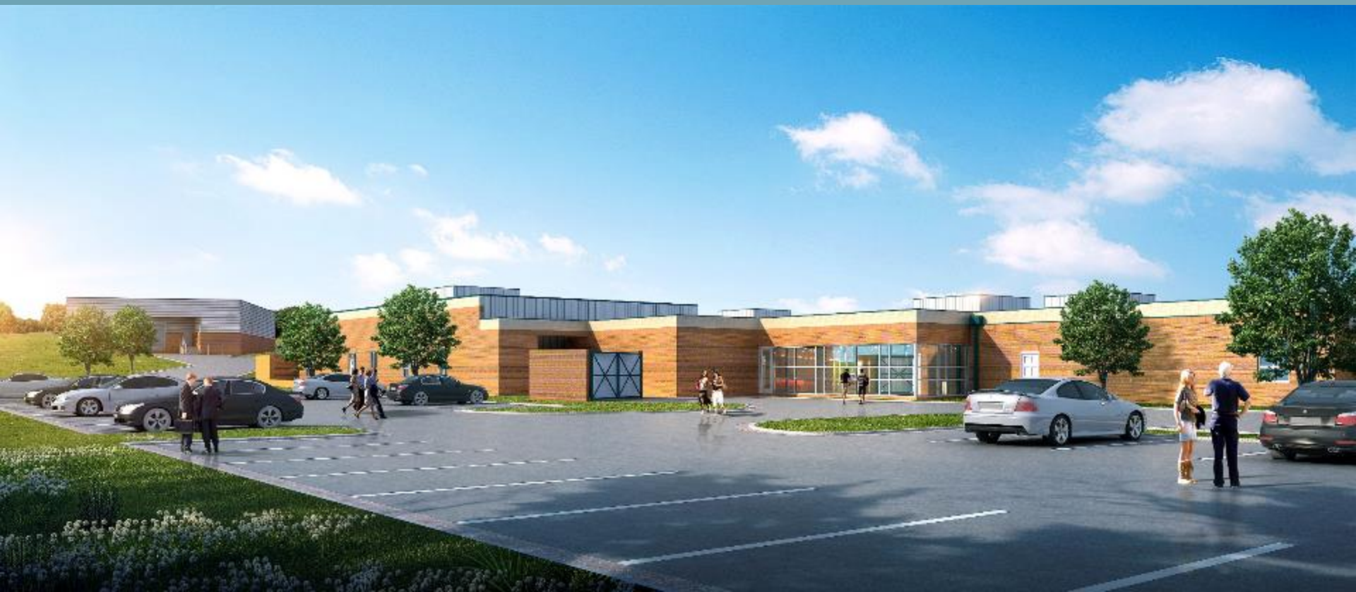
Men's Campus Rendering