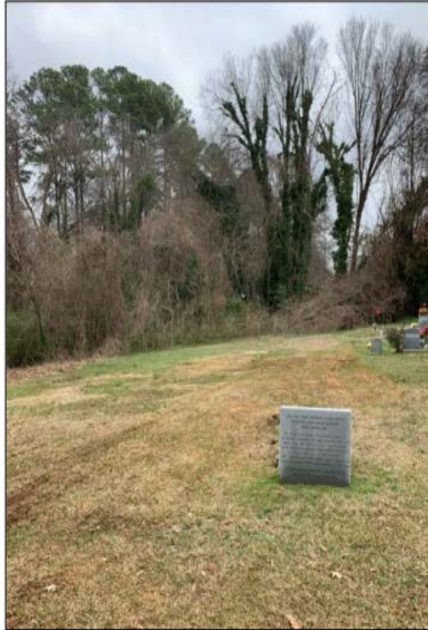
Figure 24. Proposed Reinternment Location for the Simeon Zeno Young Family Cemetery Burials at Oakwood Cemetery.