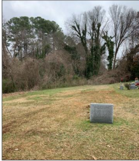
Figure 24. Proposed Reinternment Location for the Simeon Zeno Young Family Cemetery Burials at Oakwood Cemetery.

Additionally, the Wake County Planning staff posted a public hearing notification sign along the Sauls Road road frontage directly in front of the cemetery on August 7 th , 2020 and ran the two standard public hearing notices in the News and Observer newspaper on August 7 th and 10 th , 2020. The legal advertisements and posted sign included contact information for the Planning staff. The Planning staff has not received any phone calls or inquiries related to this request in response to these notification efforts.