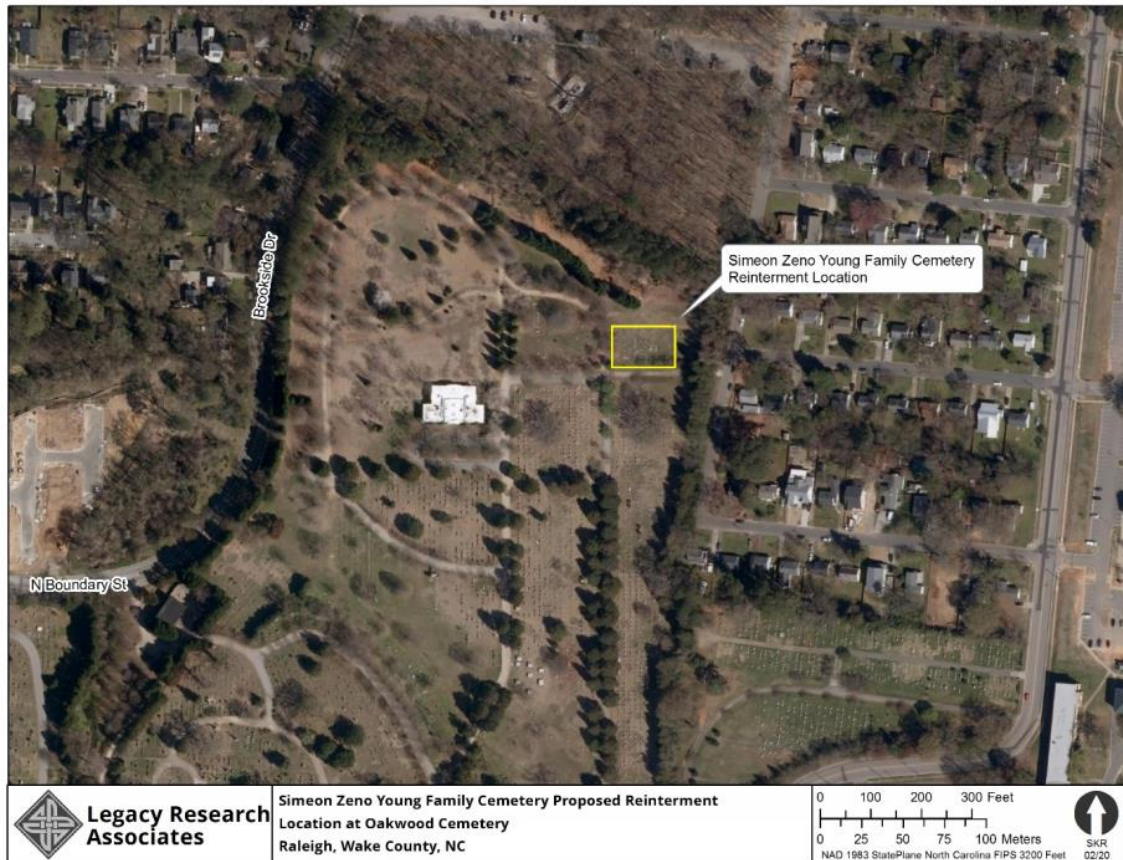
Figure 23. Proposed Reinterment Location for the Simeon Zeno Young Family Cemetery Burials at Oakwood Cemetery.

The petitioner placed a legal advertisement in the Raleigh News and Observer newspaper for four (4) consecutive weeks in an attempt to notify any next of kin or any other interested parties. The legal notices appeared in the newspaper on February 21 st and 28 th and March 6 th and 13 th of 2020. The petitioner has indicated that they did not receive any response to the newspaper advertisements.