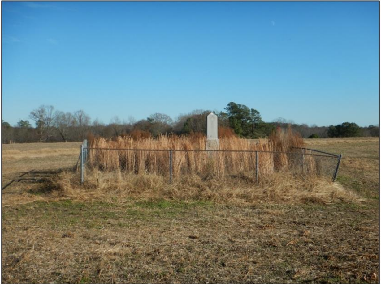
Figure 13. Simeon Zeno Young Family Cemetery before clearing, view east.

There was no further evidence of burials (i.e. - individual grave markers or depressed grave shafts) within the 25-foot by 30-foot chain link fence enclosure around the cemetery. There is no indication of any graves outside of the fenced area and it should be noted that the surrounding field is approximately one foot lower than the fenced-in cemetery resulting from many years of cultivation.