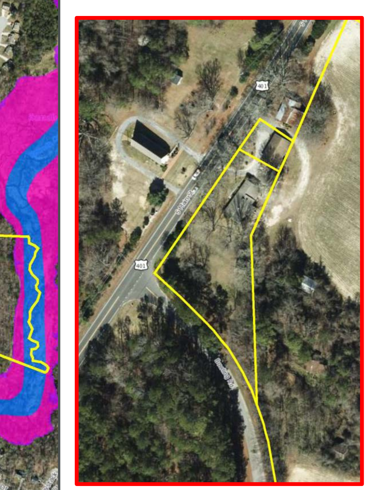
Subject Property Inset