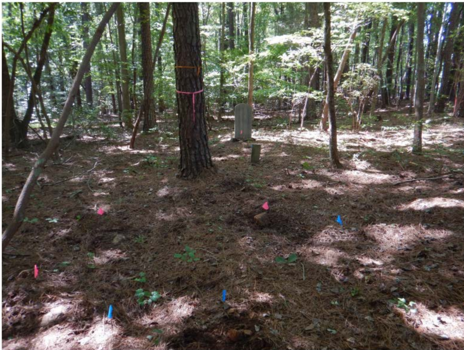
Figure 18. Harris Cemetery, view west showing Graves 5, 6, and 7 (pin flags: head pink and foot blue) and Grave 4 (Tessie Harris Evans).