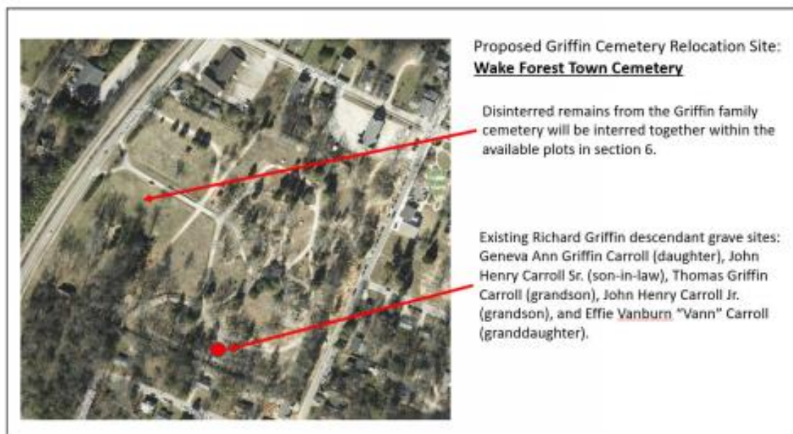
Figure 16. Proposed Relocation of the Griffin Cemetery at Wake Forest Town Cemetery.