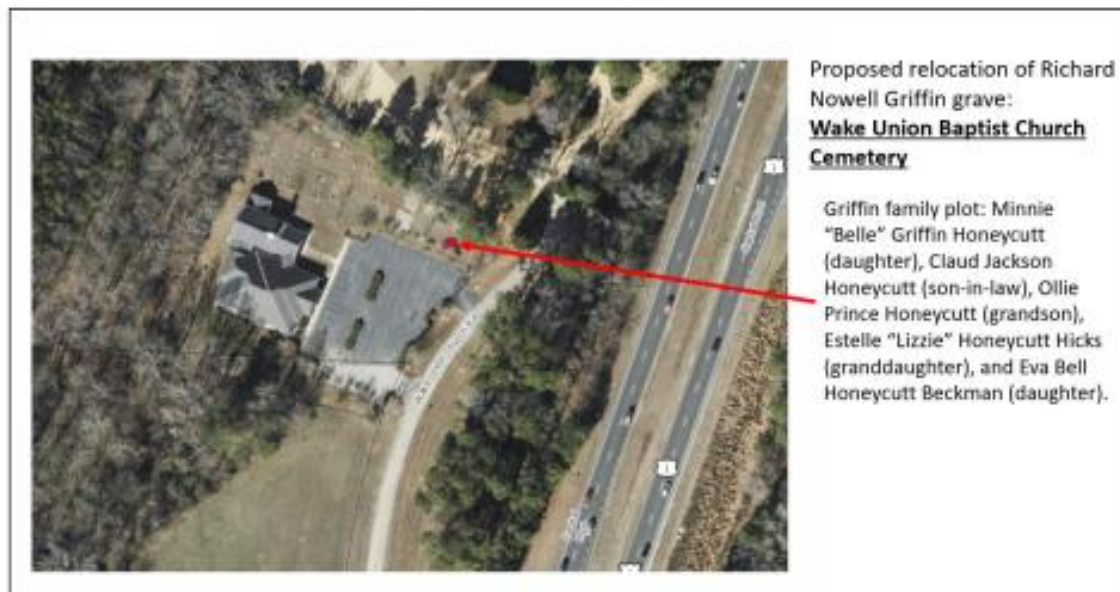
Figure 15. Proposed Relocation of the Richard Nowell Griffin Grave at Wake Union Baptist Church Cemetery.

Under the North Carolina General Statutes, any grave that is disinterred is required to be reinterred in a suitable cemetery or burial ground. The remains within these graves that are petitioned for removal, if approved, would be reinterred, as per the family's wishes (see attached letters) within the Wake Union Baptist Church Cemetery and the Town of Wake Forest Cemetery, where they will receive perpetual care (see reinterment site maps below). The family's preference would be to reinter all of the remains together, however there is only one remaining grave site available in the family's burial plot at Wake Union Baptist Church Cemetery and no other plots are available for purchase. There are descendants of Richard Nowell Griffin buried in each of the proposed reinterment cemeteries as noted on the attached reinterment maps.