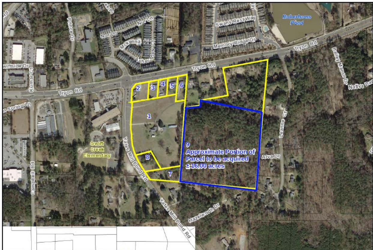
Total Assemblage - Yates Mill Pond Rd