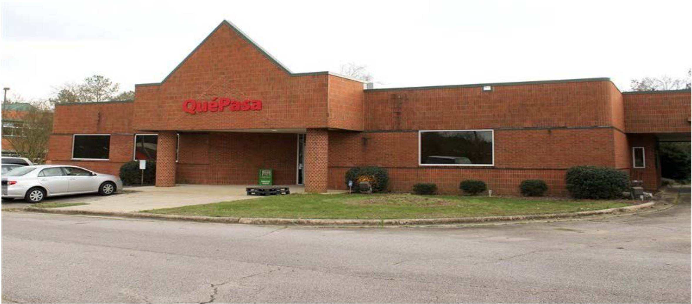
New Bern Ave. View