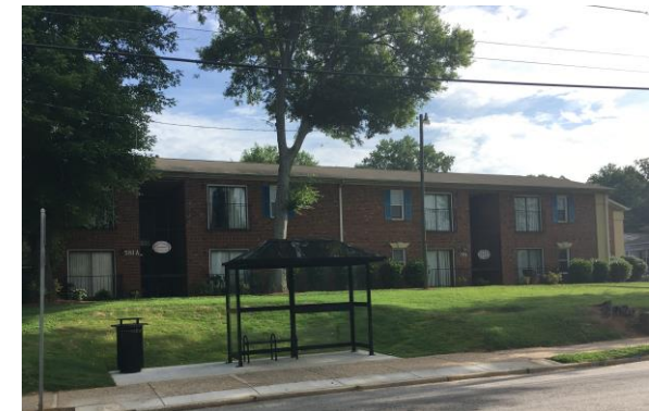
New shelter at Lenoir and Haywood Street in Raleigh