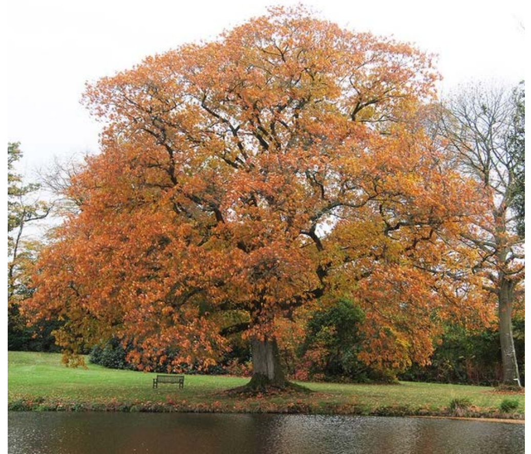
Native red oak