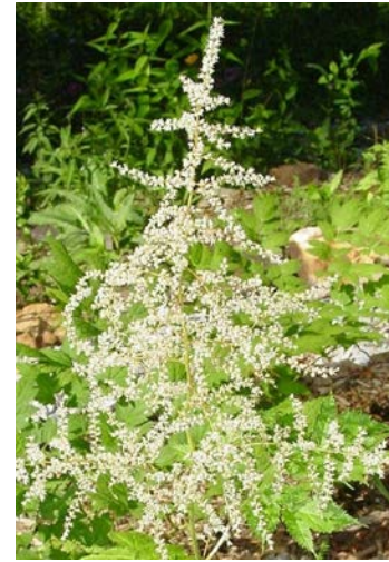
False Goat's Beard