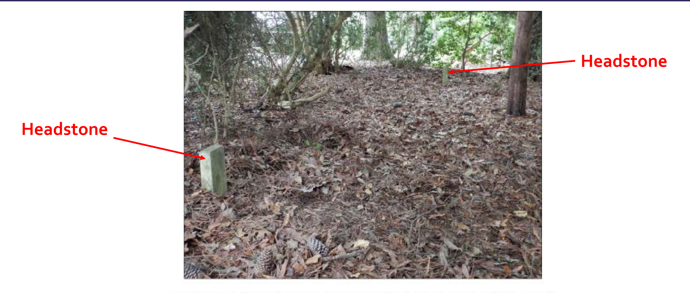
Figure 9. Elmore Property Abandoned Cemetery showing the two headstones, view northeast.