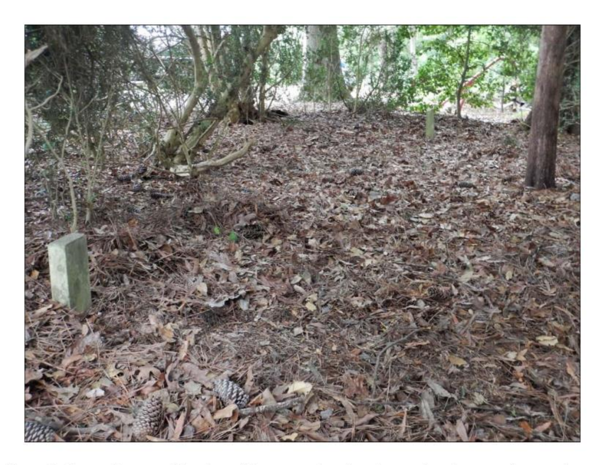
Figure 9. Elmore Property Abandoned Cemetery showing the two headstones, view northeast.

Even though there is no visible evidence of additional graves in this area, there is a possibility that there may be additional undetected graves whose presence cannot be known until full excavation of the site.