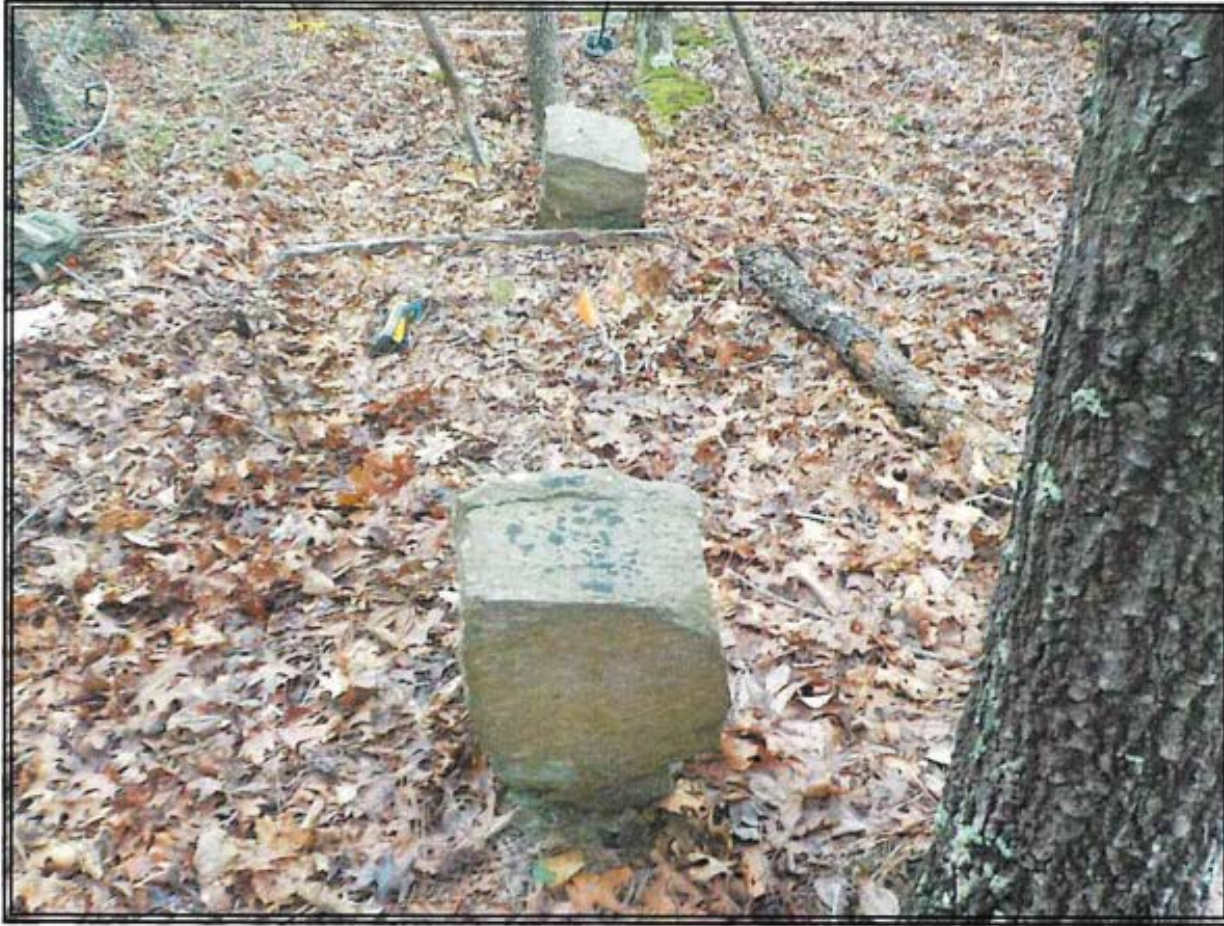
Figure 8. View of stone markers at Grave 2, facing east.