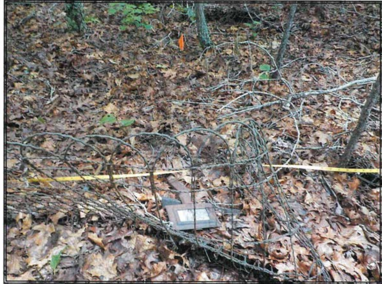
Figure 12. View of disturbed metal plaque at Grave 4 within fence, facing east.