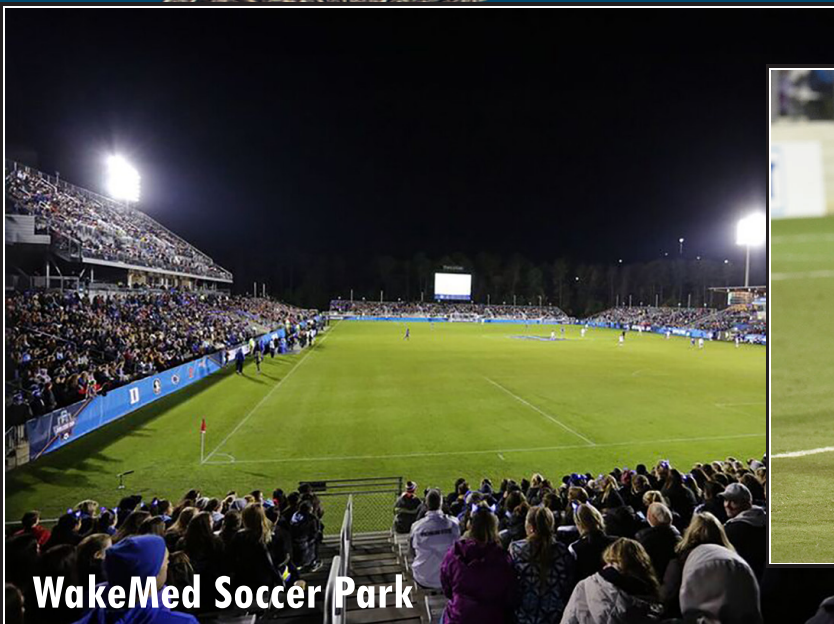
WakeMed Soccer Park