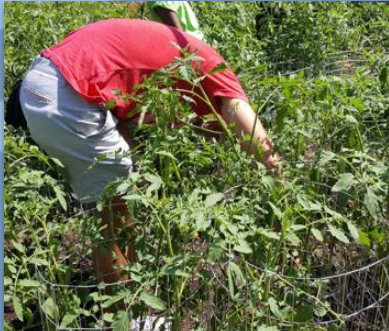
Emergency to Capacity-building