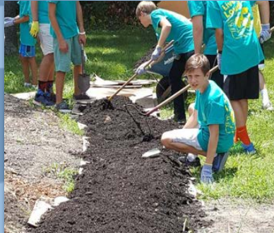
Individual Child to Family