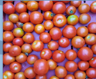
Single Sector to Food Systems Approach