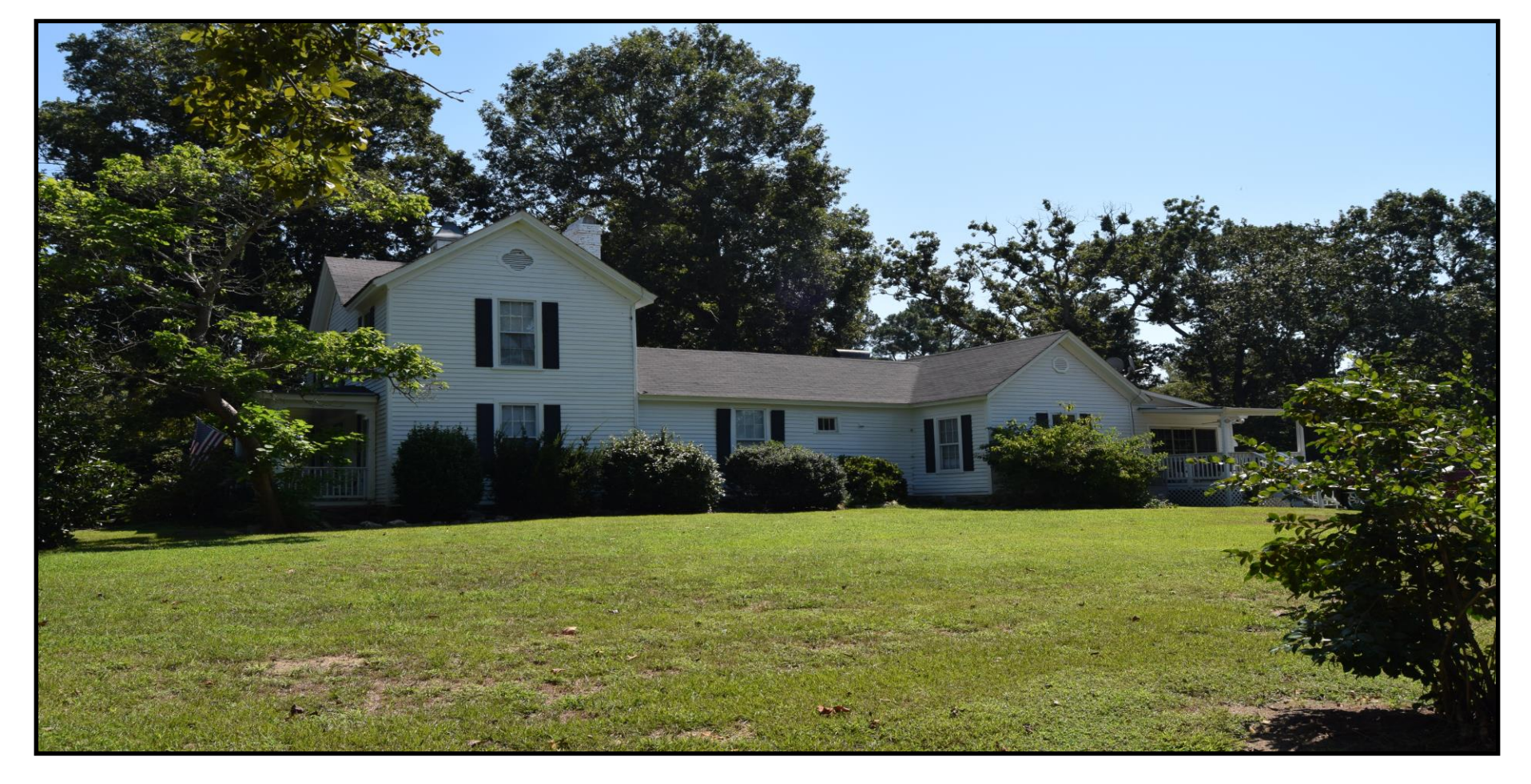
Joseph Blake House, side view