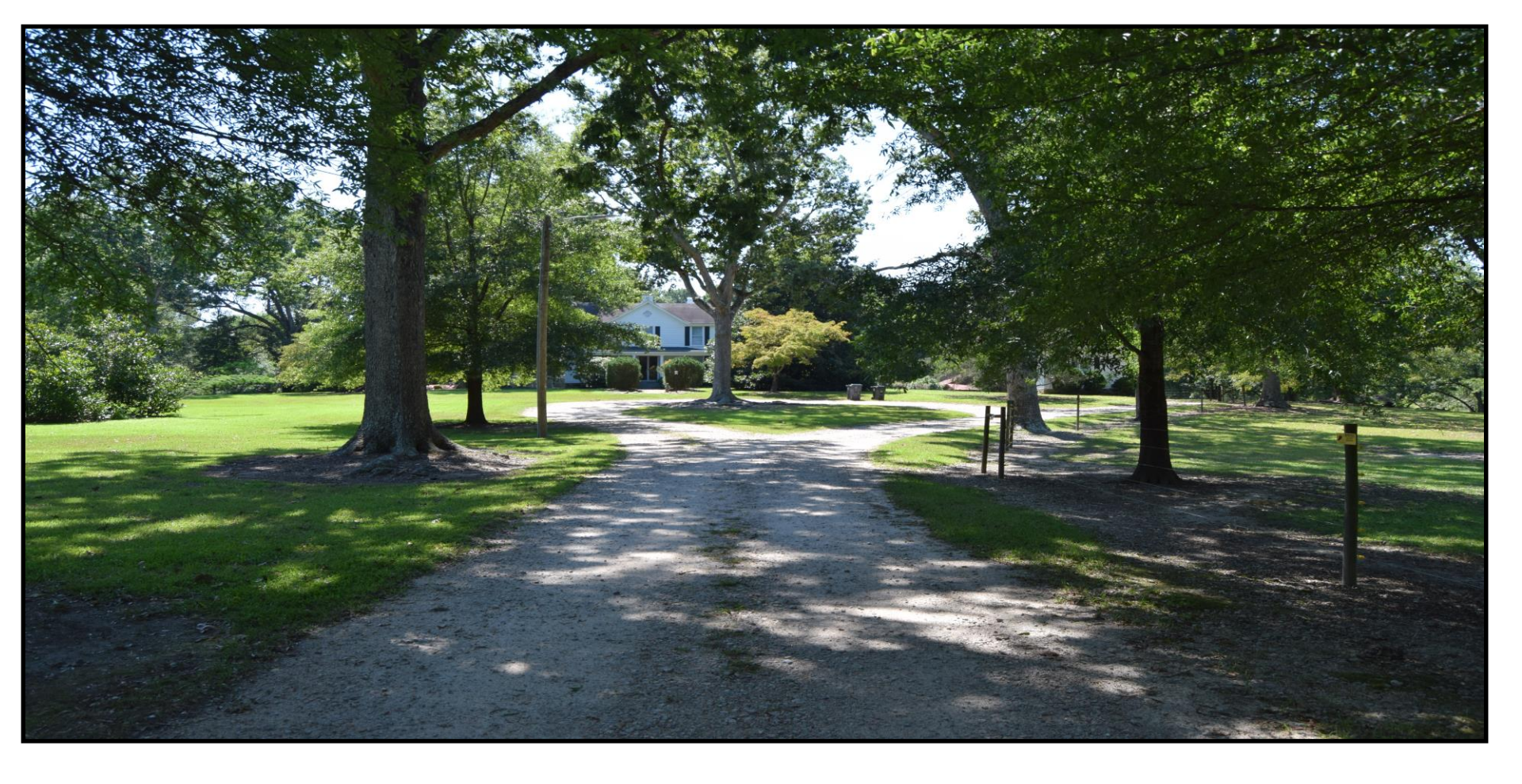
Joseph Blake Farm, view from Mial Plantation Road