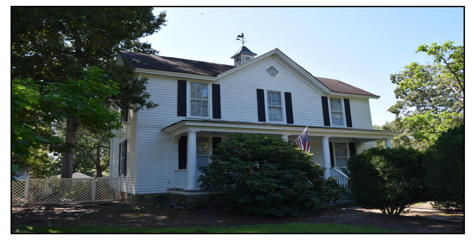
Joseph Blake House, front view