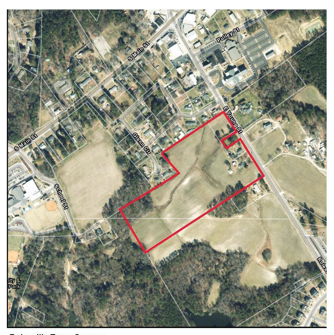
Rolesville Town Campus