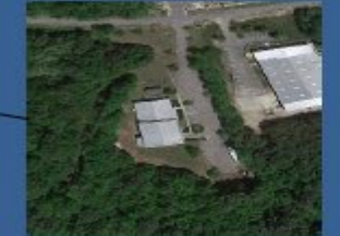
Eastern Wake Education Center