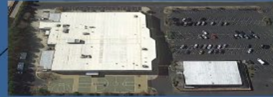
North Wake College & Career Academy