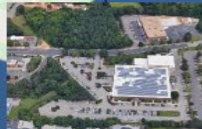
Public Safety Education Campus