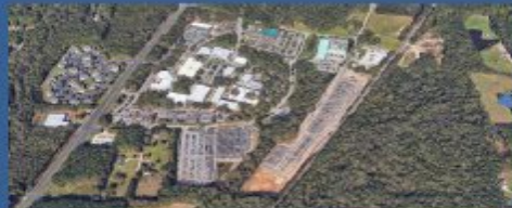
Southern Wake Campus (various campus facility upgrades and renewal projects)