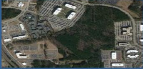
RTP Campus (new Cyber Science Building and parking deck)