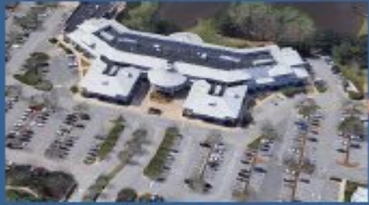
Western Wake Campus (existing leased facility to be replaced with new 34± acre campus bordering I-540, including General Education and Culinary Sciences buildings)