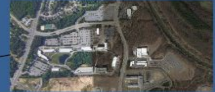
North Scott Campus