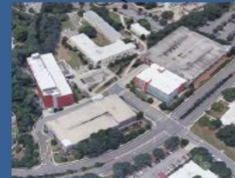
Perry Health Sciences Campus (new Health Sciences building to include simulation center, parking deck and road realignment)