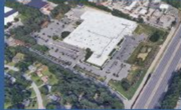
Beltline Education Center