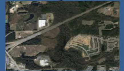
Eastern Wake 4.0 Campus (under construction opening 2023)