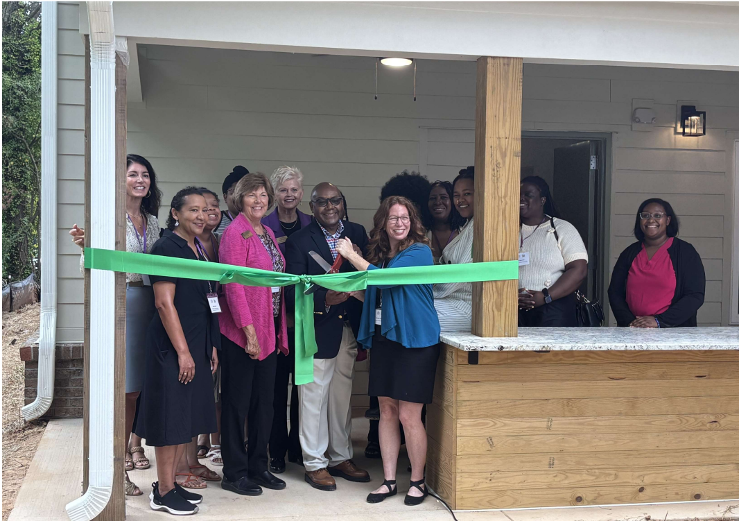
Hope Village at Method

9 units for youth aging out of foster care, Raleigh