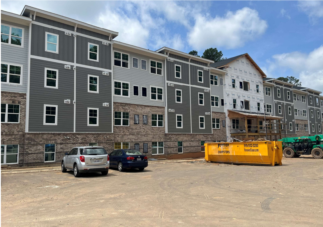
Rose Park Manor

81 senior units, Cary Developed by Beacon Management