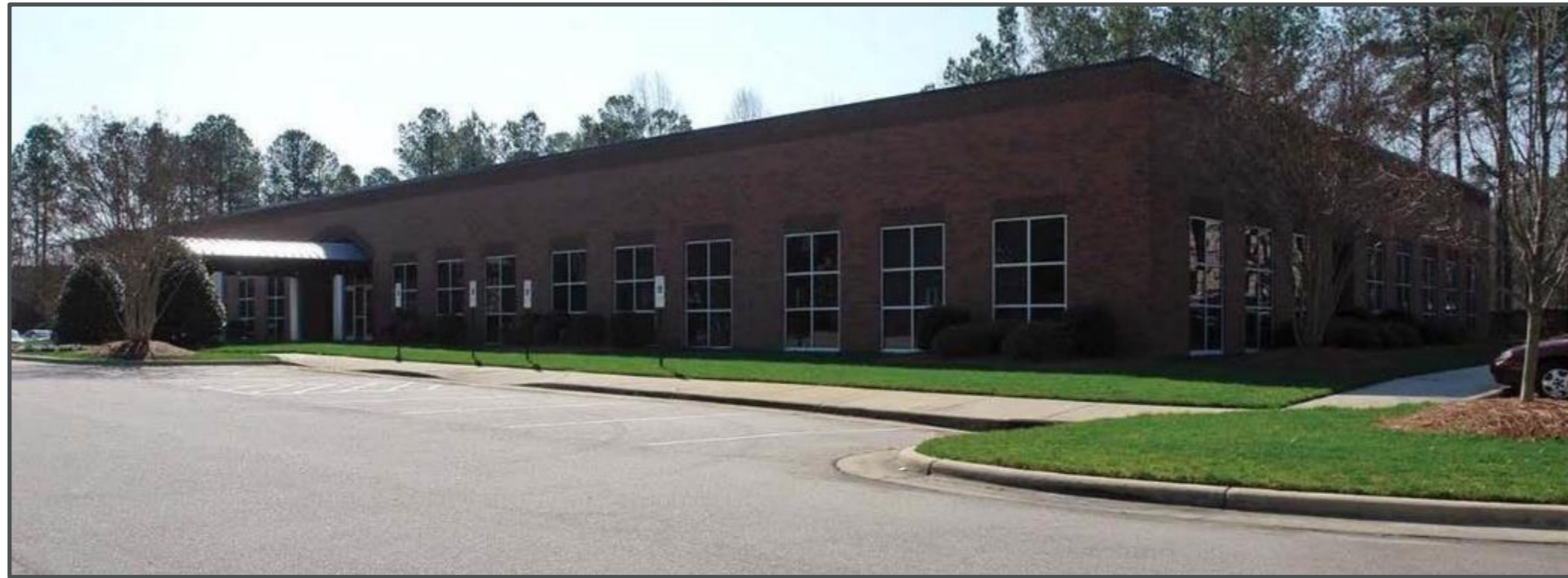
5651 Dillard Drive, Cary NC