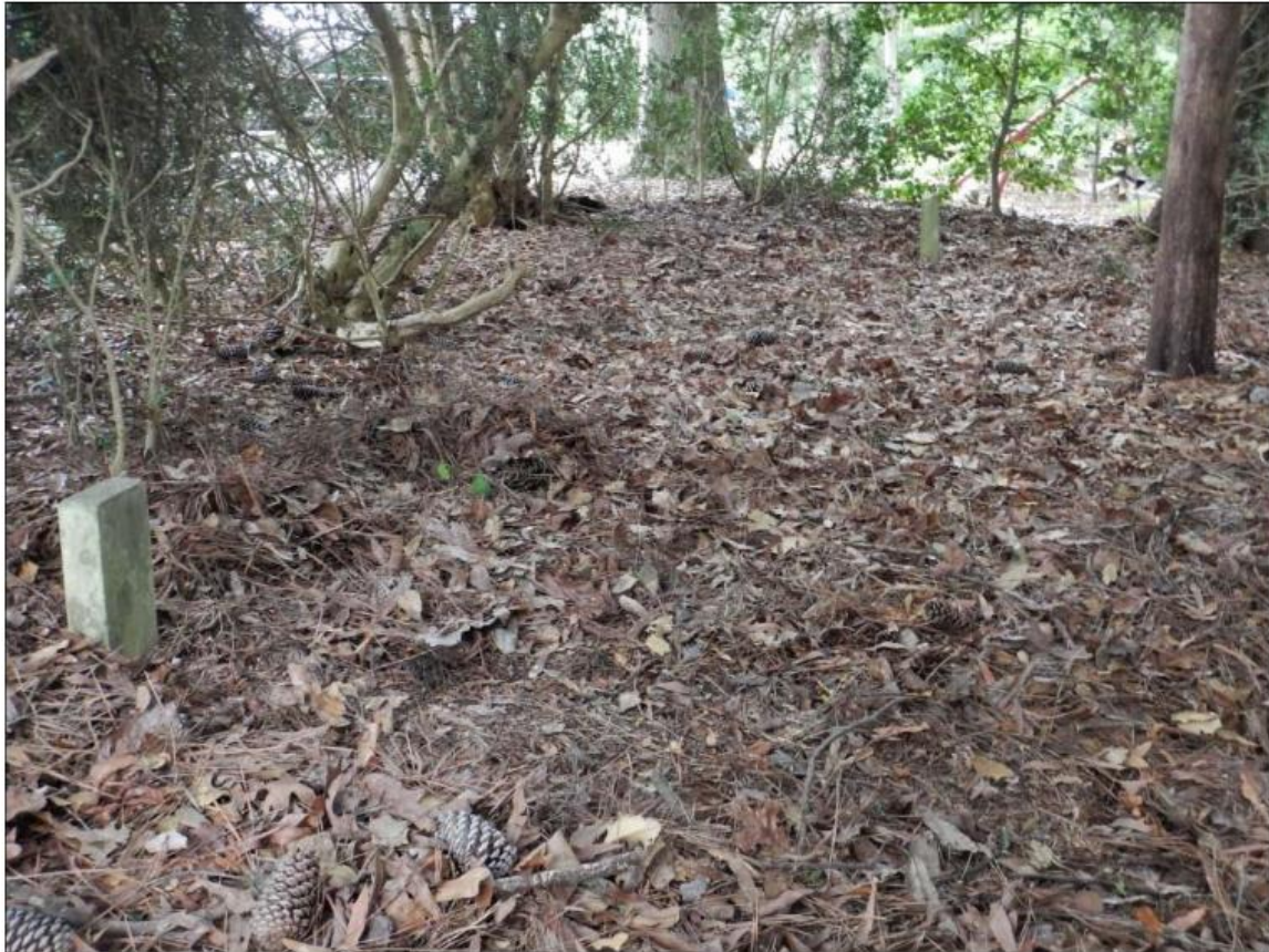
Figure 9. Elmore Property Abandoned Cemetery showing the two headstones, view northeast.

Even though there is no visible evidence of additional graves in this area, there is a possibility that there may be additional undetected graves whose presence cannot be known until full excavation of the site.