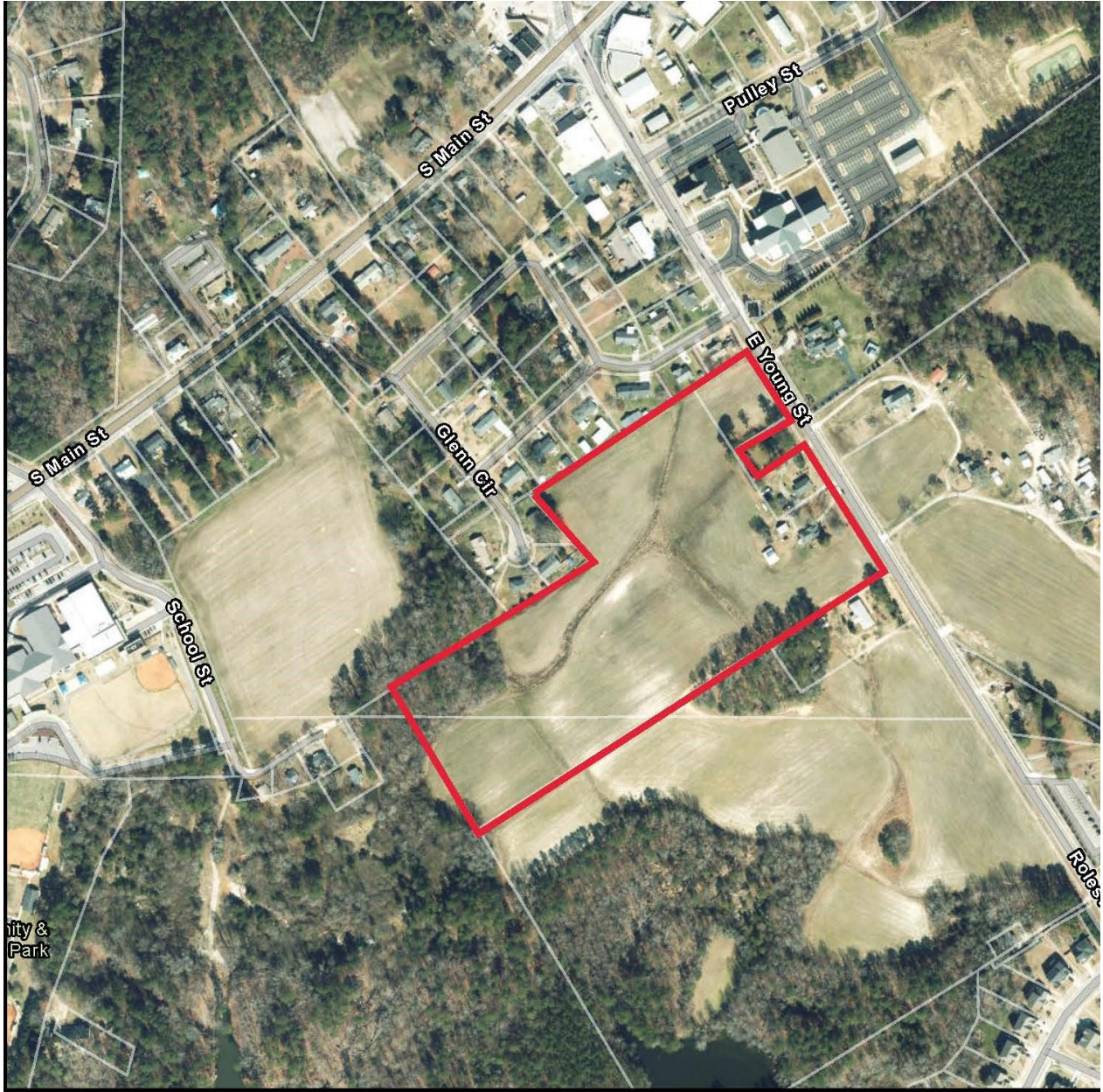
Rolesville Town Campus