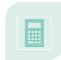
HEALTH AND HUMAN SERVICES FINANCE