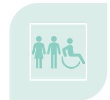
WAKE COUNTY REGIONAL CENTERS