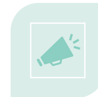
WAKE COUNTY PIO