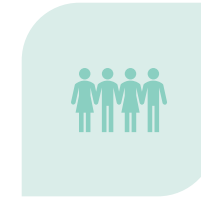
HEALTH AND HUMAN SERVICES BOARD