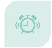
WAKE COUNTY DSS