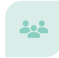
GENERAL SERVICES ADMINISTRATION

Considerable appreciation to our esteemed partners, who effortlessly assisted Public Health to achieve this pivotal milestone.