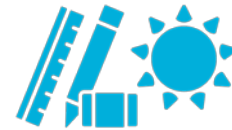
Summer Learning Resources